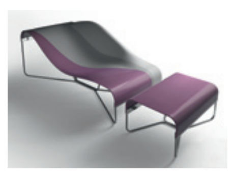
Runon chaise longue and pouf/coffee table by TAO Esterno for "Corian* Colour Evolution" exhibition (2012 Milan week of design); design Setsu and Shinobu Ito; photo Leo Torri for DuPont™ Corian*

Whether as a working service counter, a stylish display system, a stand-alone piece of furniture or a decorative object of desire, Corian® applies its malleability to meeting whatever need it was created for. Its beauty lies in its strength, however delicate the aesthetic aimed for in its design. Furthermore, Corian® is harmonious with many other materials and offers an exclusive colour palette of timeless hues.